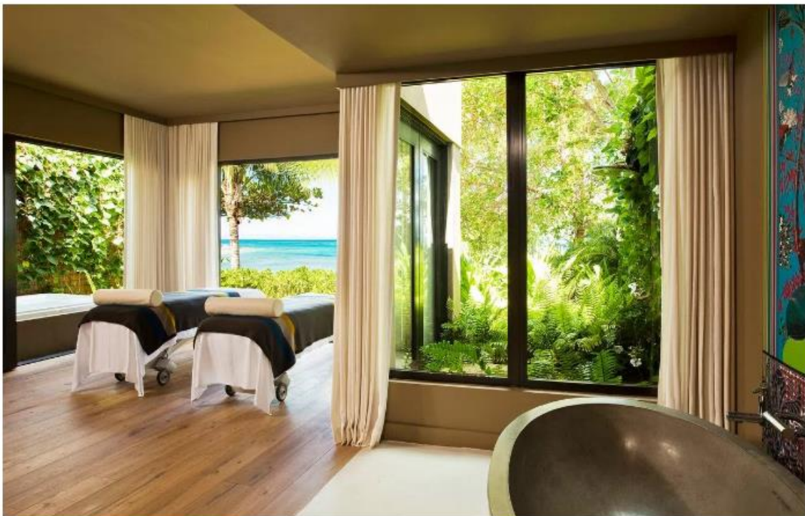
W Retreat and Spa, Vieques Island – Spa

Alpha Male Facial: At W Retreat & Spa – Vieques Island , the anti-aging Alpha Male Facial at the signature AWAY Spa treats common male skin irritations like razor burn and sun exposure. The face is cleansed and exfoliated before a customized mask is prepared for a radiant finish.