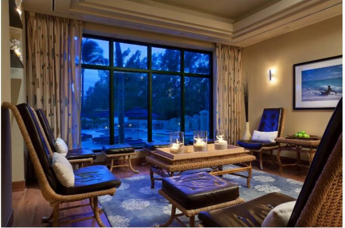
Marriott Harbor Beach The Spa Relaxation Room