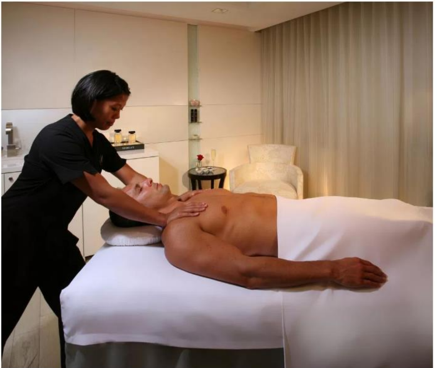
Male Massage at the Guerlain Spa

From beer-infused body treatments and facials targeting razor burn, to massage that improve his golf swing – these personalized spa experiences leave men feeling relaxed, refreshed and appreciated.