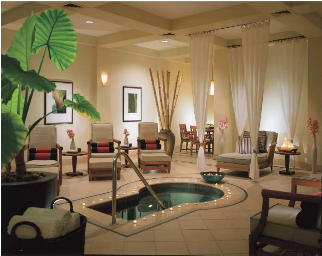
Well & Being Spa at the Four Seasons Resort

Alpha Male Facial: At W Retreat & Spa – Vieques Island , the anti-aging Alpha Male Facial at the signature AWAY Spa treats common male skin irritations like razor burn and sun exposure. The face is cleansed and exfoliated before a customized mask is prepared for a radiant finish.